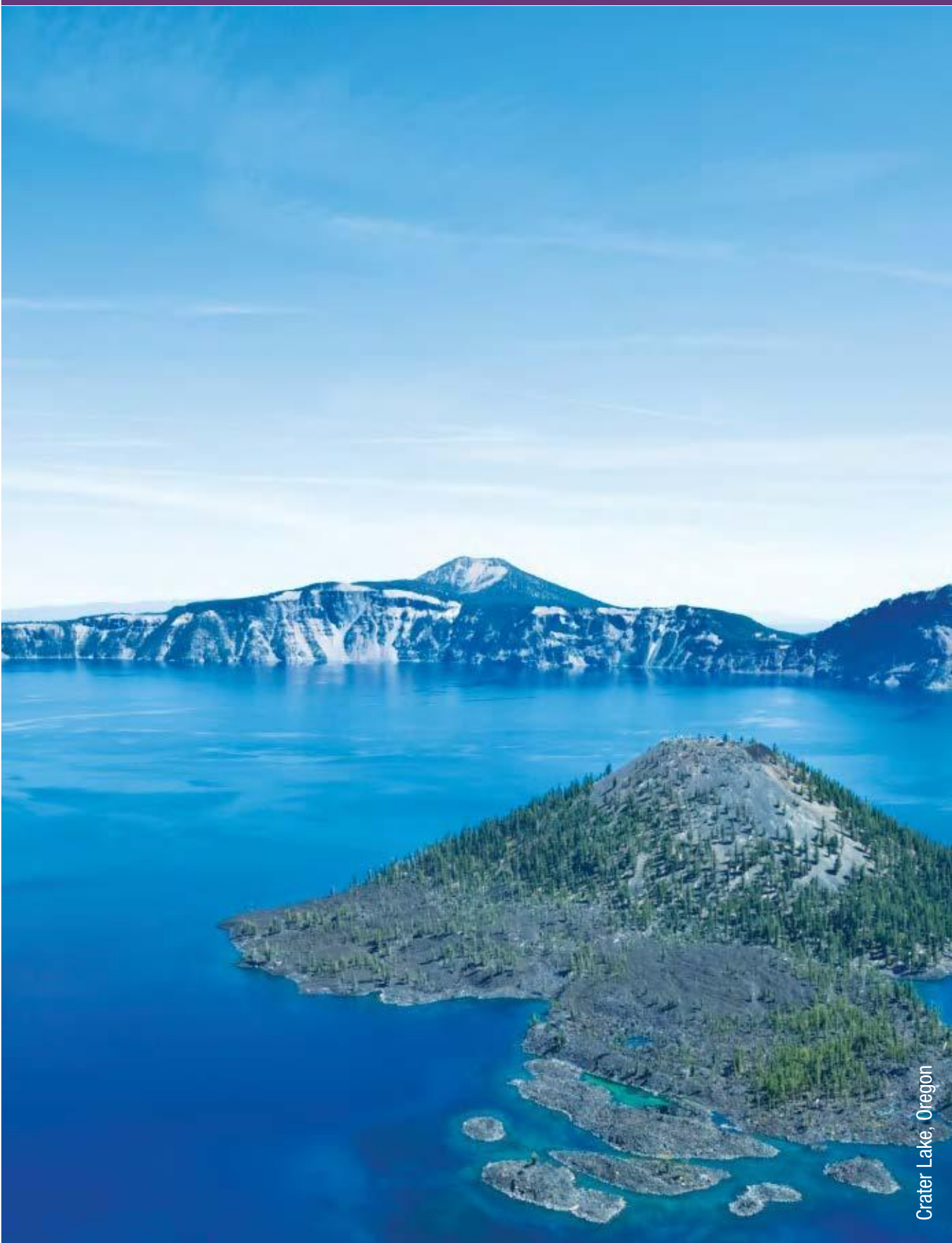
Crater Lake, Oregon