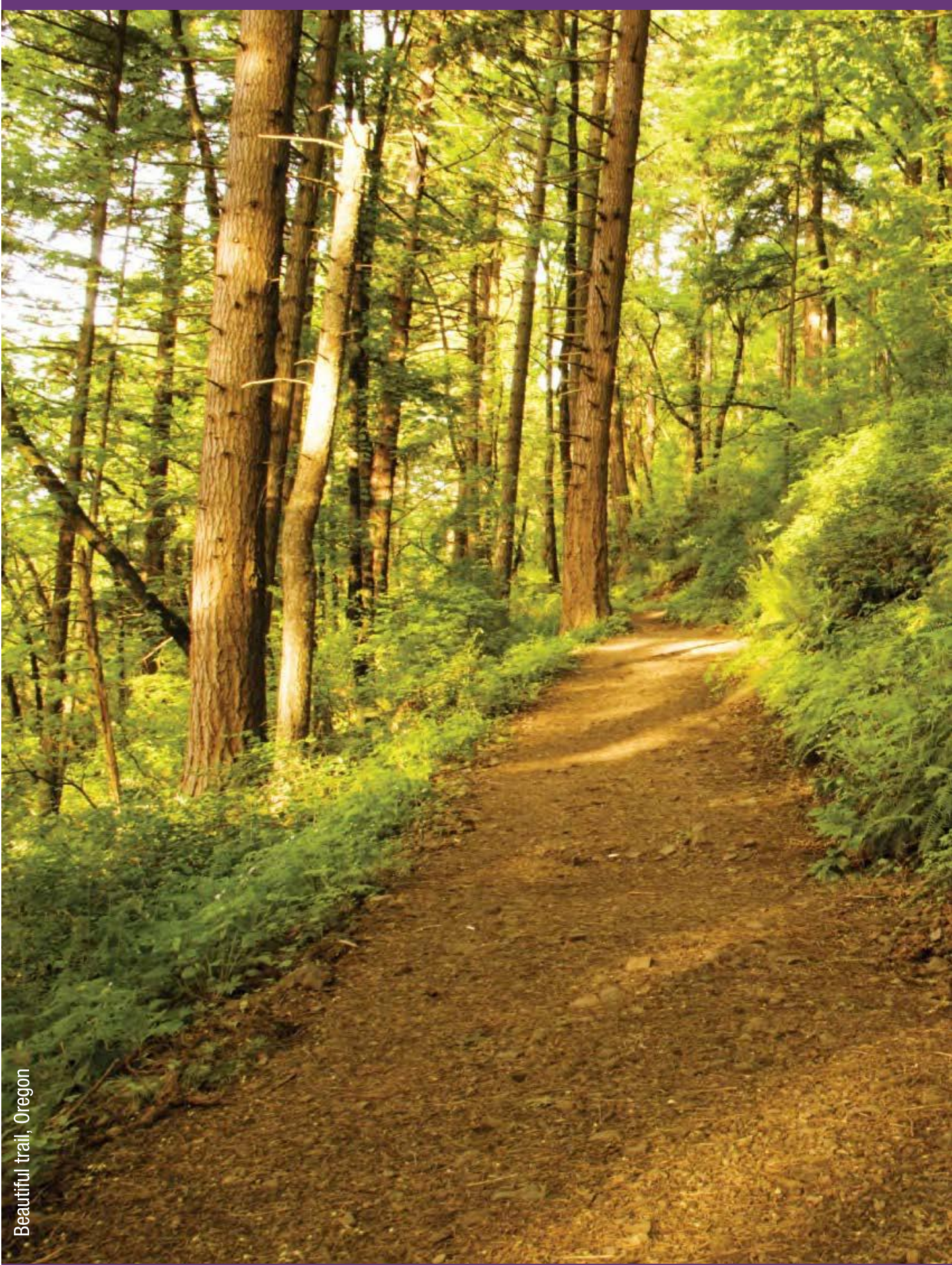
Beautiful trail, Oregon